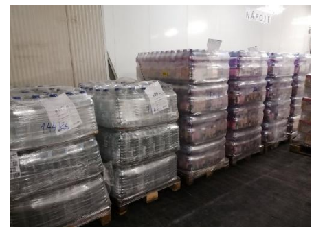
Warehouse for humanitarian aid in Nové Zámky