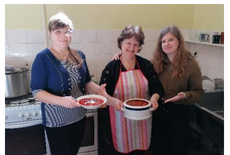
Ukrainians cooked lunch in Košice