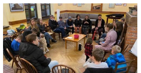
A group of refugees in Žilina