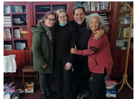
International volunteers in Košice