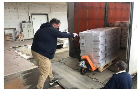
Warehouse for humanitarian aid in Nové Zámky

Last week, we informed you about our intention to prepare a shipment of humanitarian aid and transport it to Ukraine using the truck we've been offered. At the end of last week we were able to secure warehouse space in the town of Nové Zámky for a very good price. In the attached photos you can see what this warehouse for humanitarian aid looks like and also see some of the humanitarian help that has already been secured stored there. There is a busy atmosphere there and almost every day something is going on, things are being prepared and new food, cosmetics and other humanitarian material continues to arrive. We are very grateful to the volunteers, brothers and sisters from surrounding churches, who came to help with tidying up and preparing the warehouse. In the coming days the truck should be ready and the