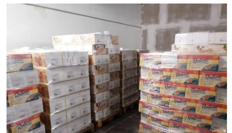
Warehouse for humanitarian aid in Nové Zámky